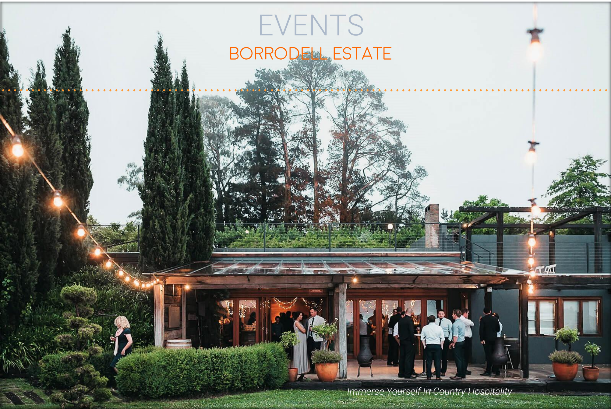
Immerse Yourself In Country Hospitality